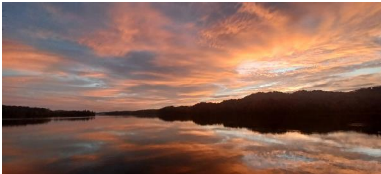
View from Notchy Creek Campground

Pristine Auto Wash is now open for business in Tellico West. The car wash can accommodate large passenger trucks as well as other passenger vehicles. It offers corporate memberships and monthly packages to local companies and the community. Call 423-295-4056 for more information. The 24/7 fully automated drive-thru carwash is located at 11 Excellence Way.